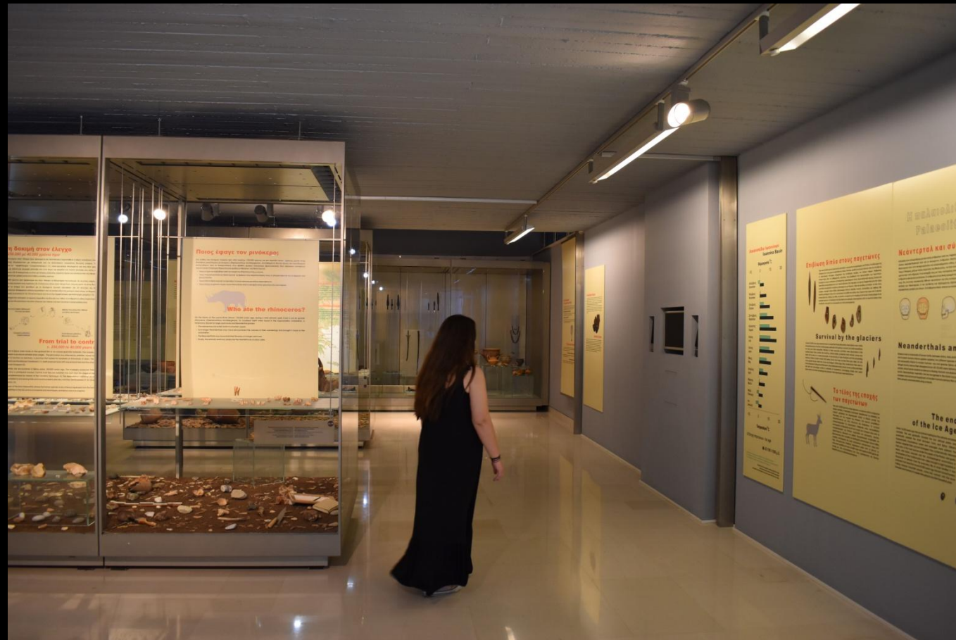
Here I am in the first hall. It is called Prehistoric Epirus.